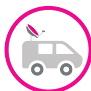
Satellite News Gathering